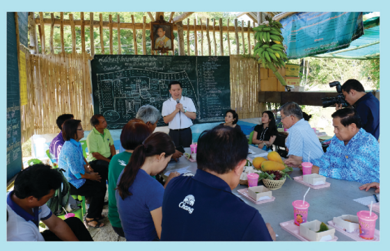
Private Sector Drives