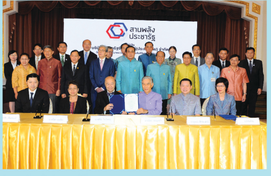
Public Sector Supports